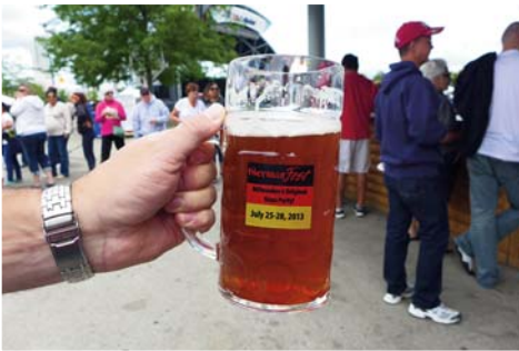
German Fest time!

The Summer Fest grounds on Lake Michigan's shore served as venue for the first COAA rally to be held at Milwaukee German Fest. Thirty-five COAA families made the trip for a total of 76 registered participants. Attendees traveled from ten states and The Netherlands bringing with them 28 instruments to share with the more than 70 thousand attendees at German Fest on Saturday and Sunday.