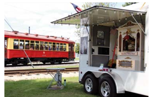
A nice mixture: trains and band organs.