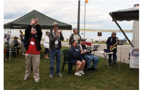
The COAA band with energetic band members.