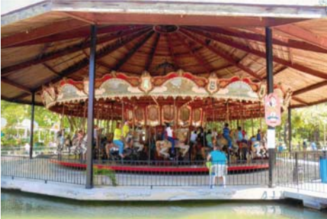
The park's carousel with its Style 33 Ruth organ.

Fifty two people gathered at Lake Winnepesaukah Amusement Park on Memorial Day Weekend, 2013. We had attendees from 15 states and Canada. There were 13 instruments in total. The weather was just beautiful. We had clear skies, moderate temperatures and no chances of rain. What better weather could we ask for?