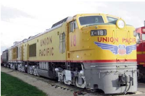
A Union Pacific train on display.

Saturday after a full day of playing the organs, everyone was treated to a guided trolley ride around the grounds of the IRM. After getting off of the trolley, everyone made a short walk to the main station for a private ride on the museum's 5-mile track behind a diesel train. After the trip, we re-boarded the trolley car as it took us around to the "Grand Pavilion" where waiting for us was a cook-out with burgers, hot dogs, and brats. Other goodies were provided as well, with one of the museum's members bringing in several freshly baked pumpkin loaves.