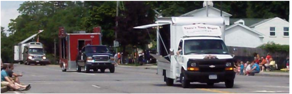
The COAA band organs make an appearance in the annual Oatka Festival parade.

Throughout the weekend, we received many unsolicited comments on how nice it was for us to be a part of the festival. There is no doubt, we'll be back!