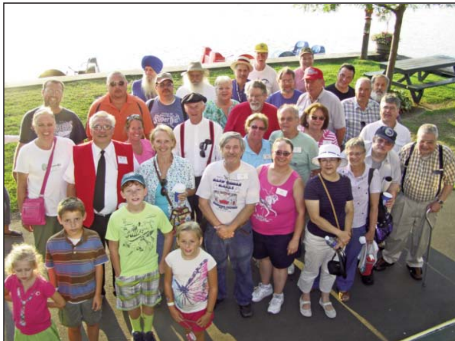
A group photo of those attending the Quassy Rally.