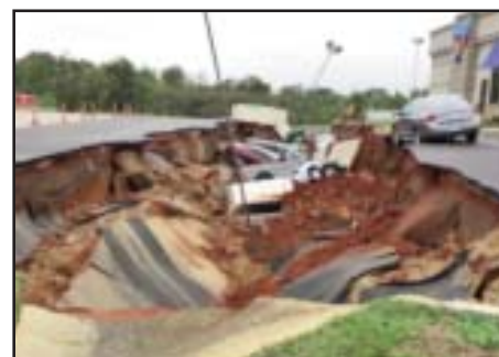
the IHOP's sinkhole.

By popular demand, we have been encouraged to host another Rally next year, 4-5 November. Watch for further details.