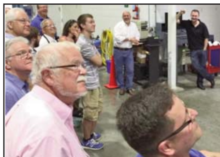
COAA members enjoying the organ concert.