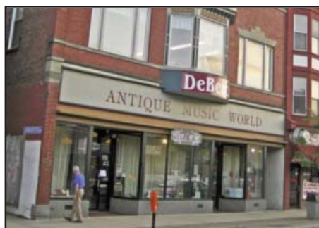
DeBence's Antique Music World museum.