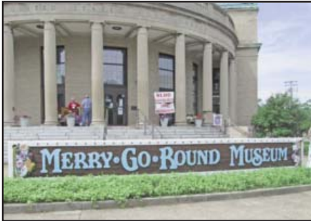
The Merry-Go-Round Museum.