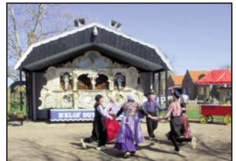
The Holland dancers with the 90-key Golden Angel in the background.