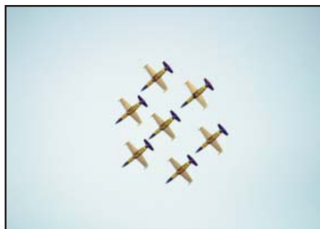
The skies were alive with plane formations.