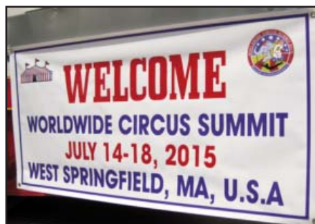
Welcome to the Worldwide Circus Summit!

The Worldwide Circus Summit (WCS) featured a stunning variety of activities. This included a live 308 piece circus band provided by the Windjammers. They were featured in the Cole Brothers Big Top, one of the few enormous tent shows still traveling today. Live entertainment included trained horse shows, dog and pony shows, a genuine sideshow, an all star Ringing Brothers reunion show, kids circuses from around the country and much more. All of this was interspersed with displays, exhibits, live talks, demonstrations and interviews. Experts from around the globe gave superb historical presentations supported with videos, photos and live acts. In short, one COAA attendee said that it was "the best rally ever attended."