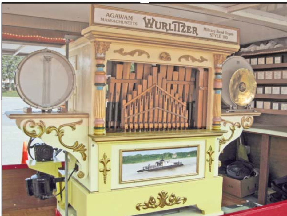
The Hallocks Wurlitzer Band Organ Style 105.