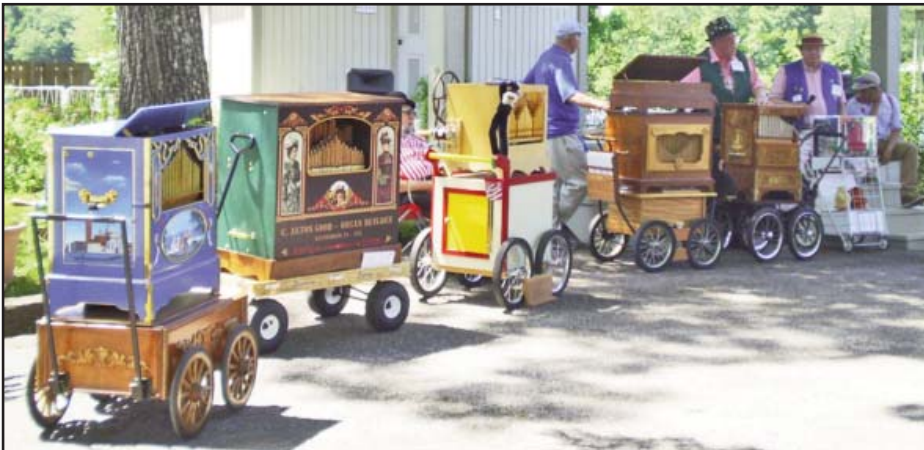
Crank organs line up for a concert.